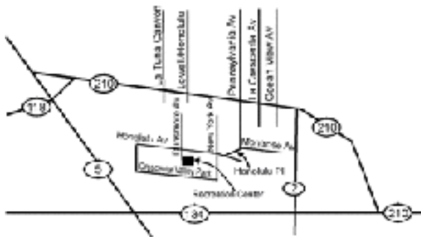
Thomas Guide 534-E-1

Crescenta Valley Regional Park Recreation Center Dunsmore & Honolulu, La Crescenta